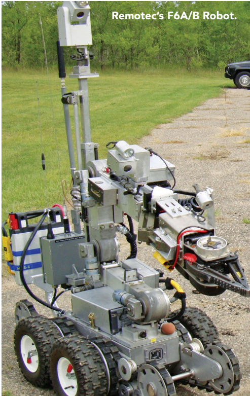
Remotec's F6A/B Robot.

quiet and is the only battery-powered rescue tool that is certified by UL as compliant to National Fire Protection Association 1936.